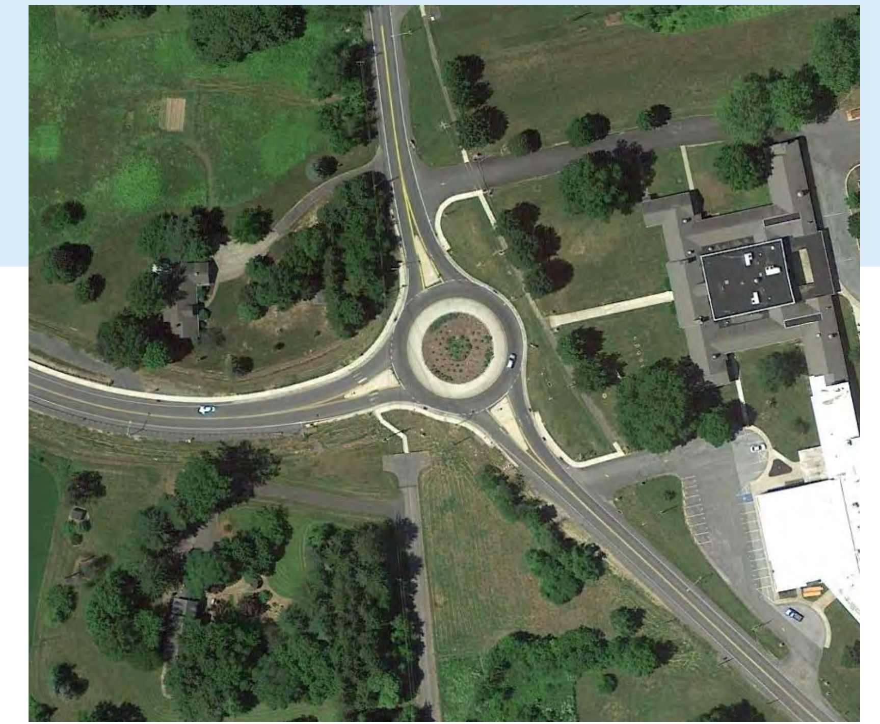
Mifflintown, Juniata County