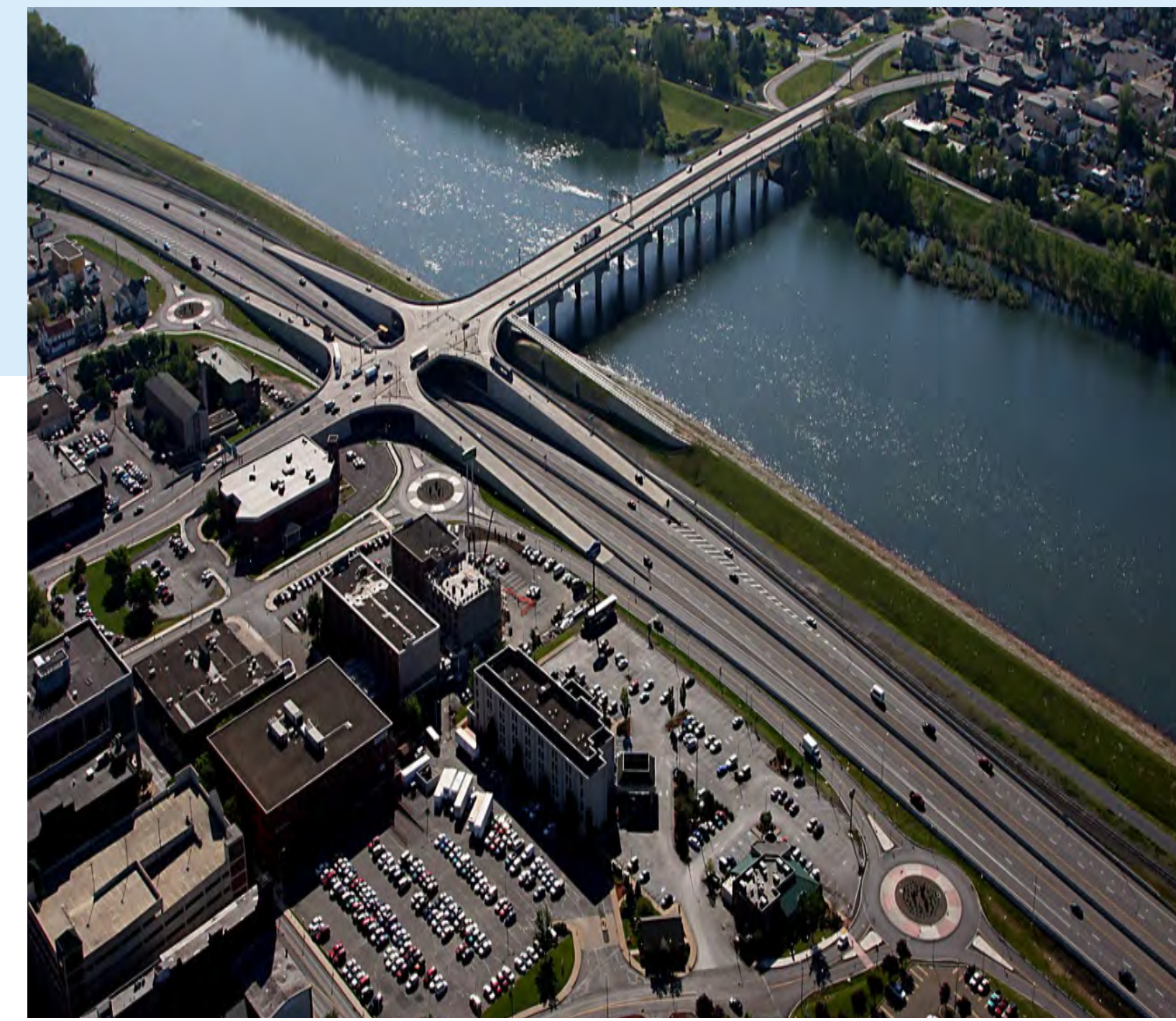
Williamsport, Lycoming County

If an emergency vehicle is about to enter or has already entered the roundabout, do not stop in the roundabout. Instead, exit out your original destination and then pull over.